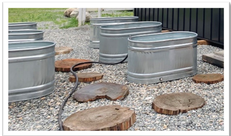
Figures 1 and 2: Stand-alone tanks found in local communities

In order to prevent formation of biofilms in the filtration and plumbing systems as well as the vessel itself, existing commercial cold plunge tanks with UV or ozone disinfection require the use of an additional residual disinfectant. 21,22 While some models recommend the use of a hydrogen peroxide product, the 2023 Model Aquatic Health Code (MAHC), which provides public health guidance for pools, hot tubs and splash pads, prohibits the use of UV/hydrogen peroxide combination systems in aquatic facilities, because neither UV nor hydrogen peroxide provide continuous disinfection in the form of a residual. 9 Therefore only chlorine or bromine should be used in conjunction with UV or ozone. In addition to regular cleaning, the presence of residual disinfectants in the water also helps minimize biofilm